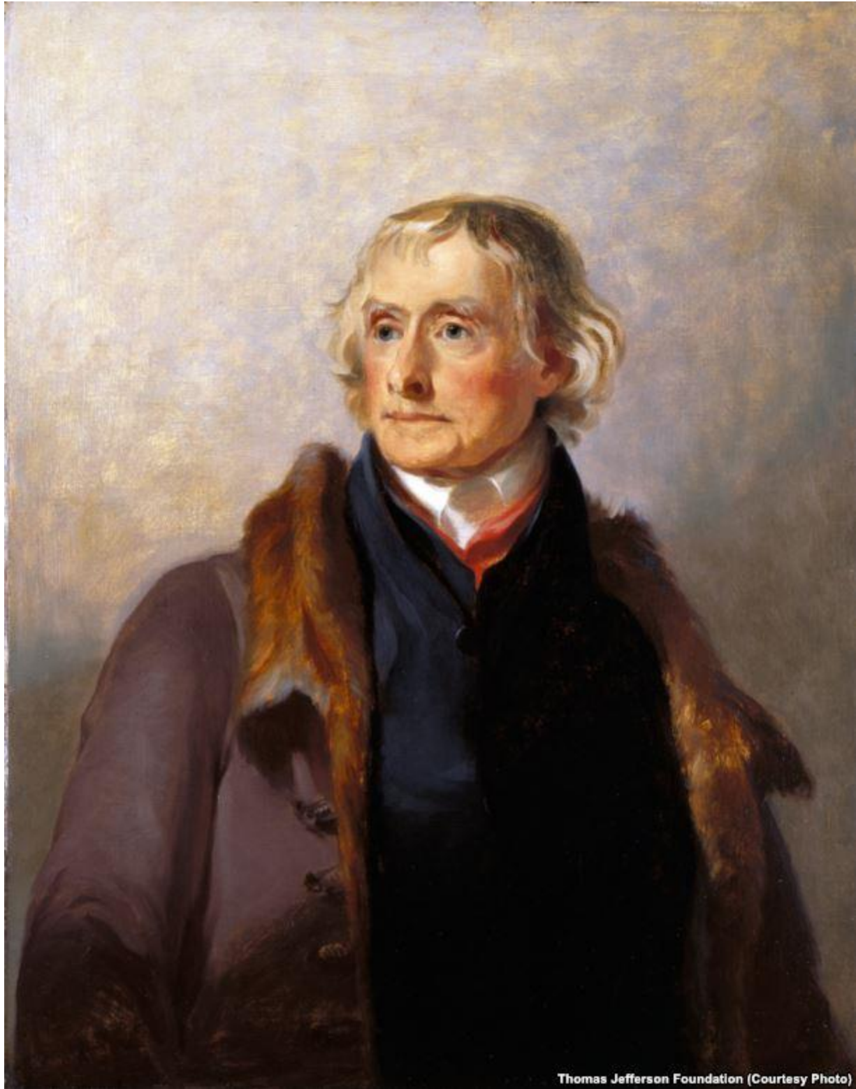
Portrait of Jefferson by Thomas Sully, 1821